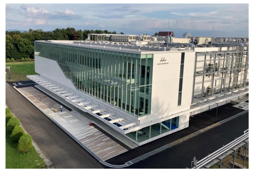
(External view of EMITS)