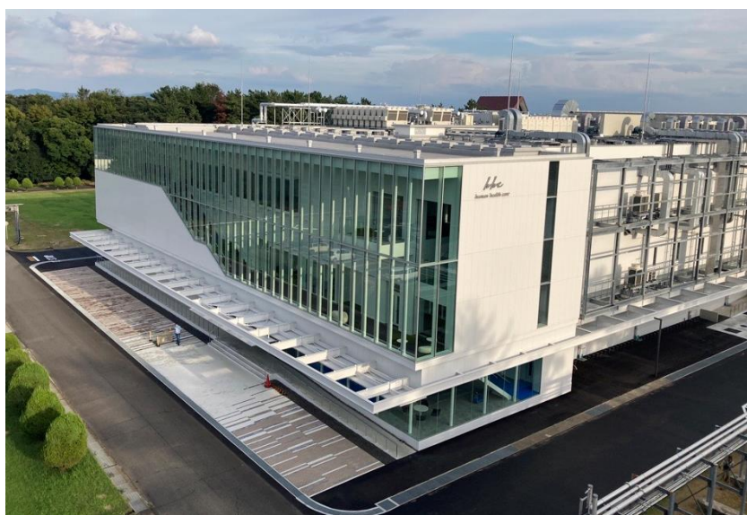
(External view of EMITS)