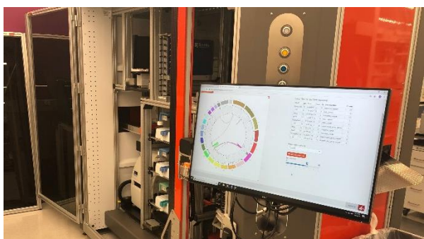
(Equipment of Data Science)