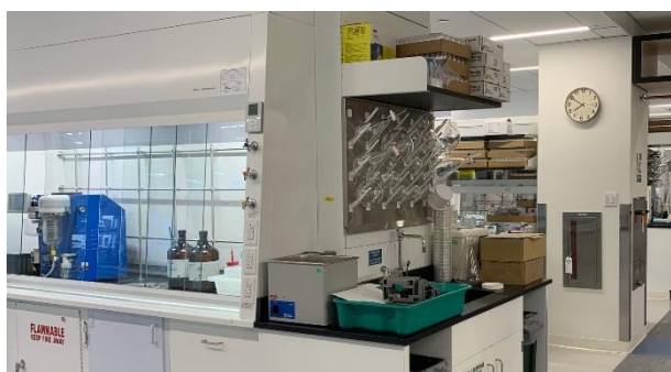
(Space of Precision Chemistry)